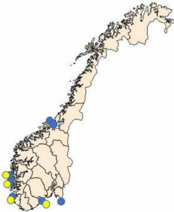
Figure 3. Sampling of flat oysters, Ostrea edulis , and blue mussels, Mytilus spp. in the surveillance programme for Bonamia sp. and Marteilia sp. Yellow circles indicate the sampling sites for flat oysters. Blue circles indicate the sampling sites for mussels.