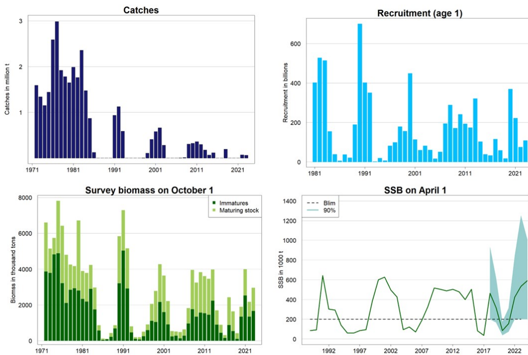
Figure 1. Barents Sea capelin (ICES subareas 1 and 2, excluding Division 2.a west of 5°W). Catch, recruitment, survey biomass (age 1+, maturing (> 14cm) and immature (< 14 cm) stock biomass), and SSB (1 April) with 5 and 95 % confidence limits. The biomass reference points relate to SSB. Survey biomass and recruitment values are estimates from the acoustic survey completed by the beginning of October. The recruitment plot is shown only from 1981 onwards since earlier estimates of age 1 capelin are based on incomplete survey coverage. SSB estimates are shown only from 1989 onwards because a different model was used previously, and uncertainty estimates are only available from 2018 onwards. The 2022 estimate of recruitment, maturing and immature stock biomass has not been corrected for incomplete survey coverage. Incomplete survey coverage in 2018 might also have led to recruitment underestimation.

Spawning-stock size is above B_{lim} . No reference points for fishing pressure have been defined for this stock.