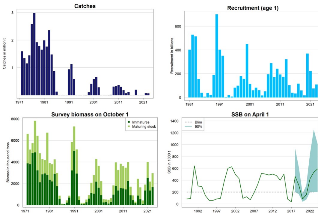
Figure 1. Barents Sea capelin (ICES subareas 1 and 2, excluding Division 2.a west of 5°W). Catch, recruitment, survey biomass (age 1+, maturing (> 14cm) and immature (< 14 cm) stock biomass), and SSB (1 April) with 5 and 95 % confidence limits. The biomass reference points relate to SSB. Survey biomass and recruitment values are estimates from the acoustic survey completed by the beginning of October. The recruitment plot is shown only from 1981 onwards since earlier estimates of age 1 capelin are based on incomplete survey coverage. SSB estimates are shown only from 1989 onwards because a different model was used previously, and uncertainty estimates are only available from 2018 onwards. The 2022 estimate of recruitment, maturing and immature stock biomass has not been corrected for incomplete survey coverage. Incomplete survey coverage in 2018 might also have led to recruitment underestimation.

Spawning-stock size is above B_{lim} . No reference points for fishing pressure have been defined for this stock.